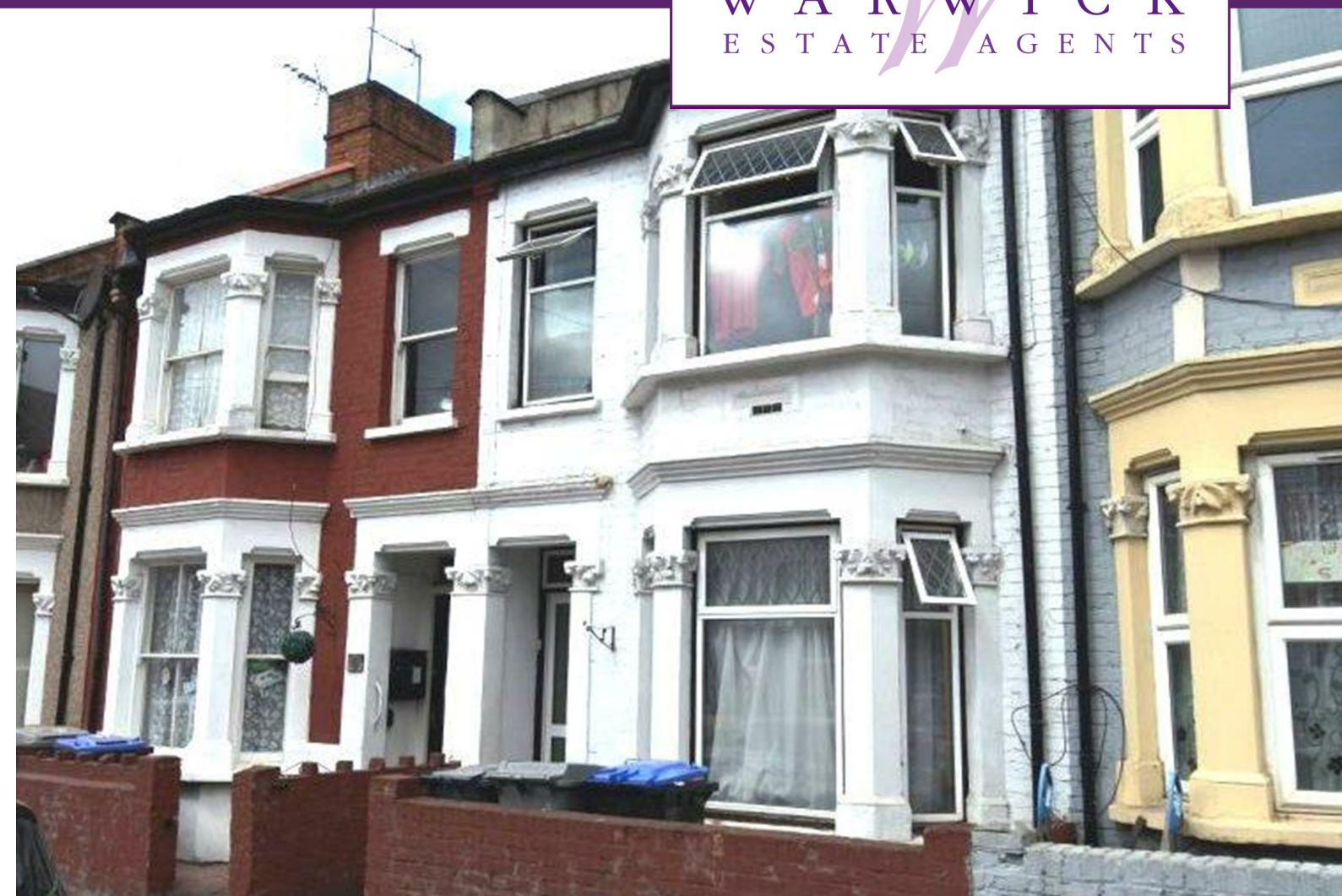
Cobbold Road, Willesden, NW10 9SU